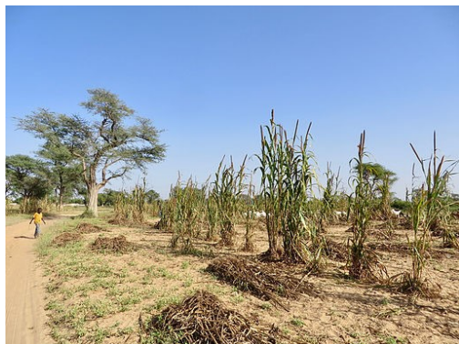
Millet farm (Millet is used to make couscous)